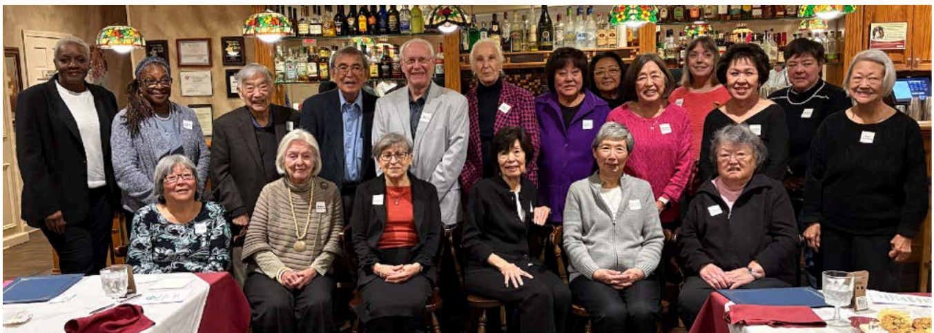
Joint SECC Board and Seabrook JACL at the Volunteers Appreciation Luncheon